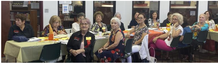
Rho members attending the first meeting for 2023-2024. All are taking note as committee members are going over Rho's yearbook along with responsibilities.