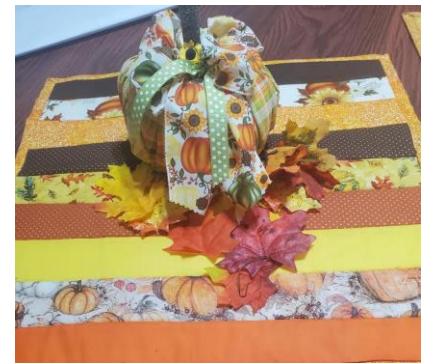
(Pictured right) Rho's September hostesses welcomed all members with fall table centerpieces. A special thank you to Nelda Requenez for sewing some of the pieces!! Thank you to all the month's hostesses.