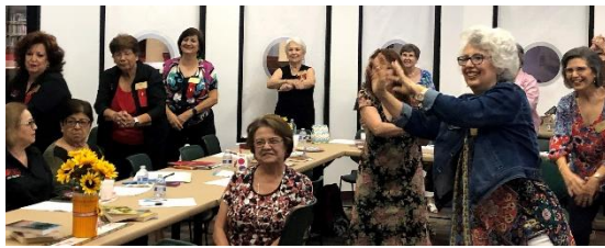
RHO members participated with Zumba fitness while some observed. Some members even had time to converse while dancing!