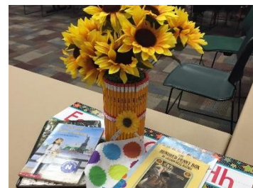
September was back to school for students but hostesses carried on the theme by providing pencil bouquets decorating the tables at the September meeting.

ASTEF is the fundraising entity supporting the Texas State Organization of Delta Kappa Gamma.