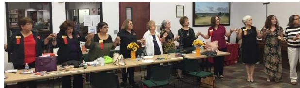
Members unite during the "Recommitment Ceremony"